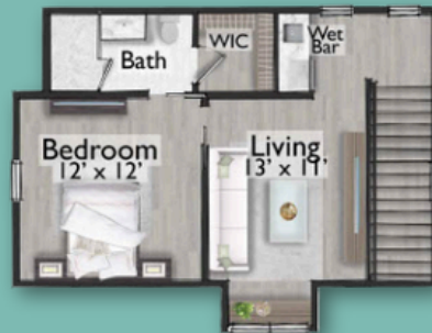
GARAGE BONUS ROOM