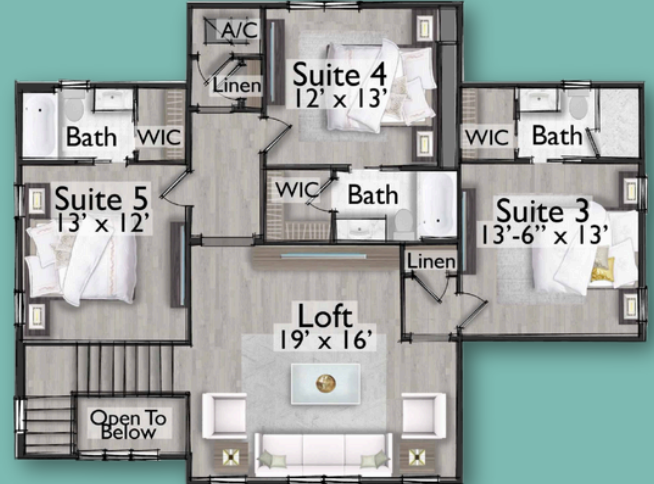
FIFTH BEDROOM/BATH + LOFT